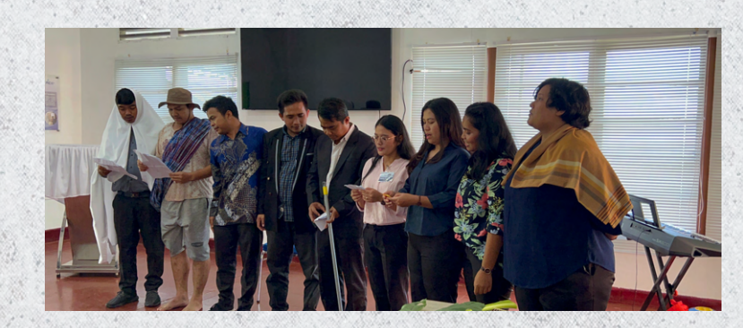
The enthusiasm and eagerness of the 19 GBKP Candidate Pastors to learn and apply their English skills are evident in their vibrant expressions and active engagements. Their sessions varied from conversational English, basic Grammar, and sentence construction.