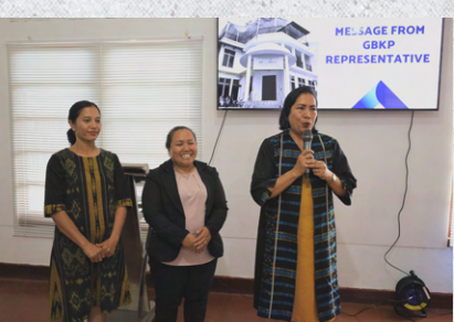
The participants were given Completion Certificates for their one month residential training in the Center. Special Awards were also given to outstanding students.